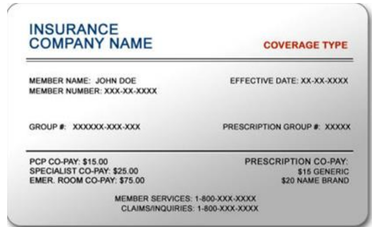
Sample Insurance Card