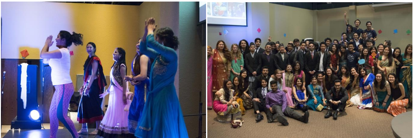
Dashain Night 2015

As you enter the U.S., your I-20/DS-2019 is stamped with the date of entry, place of entry, immigration status, and date of expiration of your stay. An I-94, which is issued electronically, must be printed after your arrival and carried with you when you travel. You will print your I-94 during orientation. These are very important documents. Do not lose them. Always carry your passport, visa, I-20/DS-2019, and I-94 with you while traveling in the U.S.