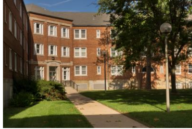
Blanton Nason Brewer Hall