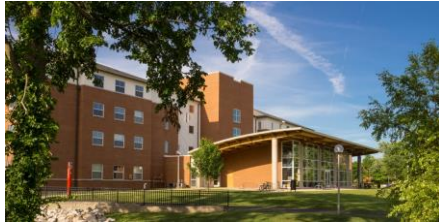
West Campus Suites